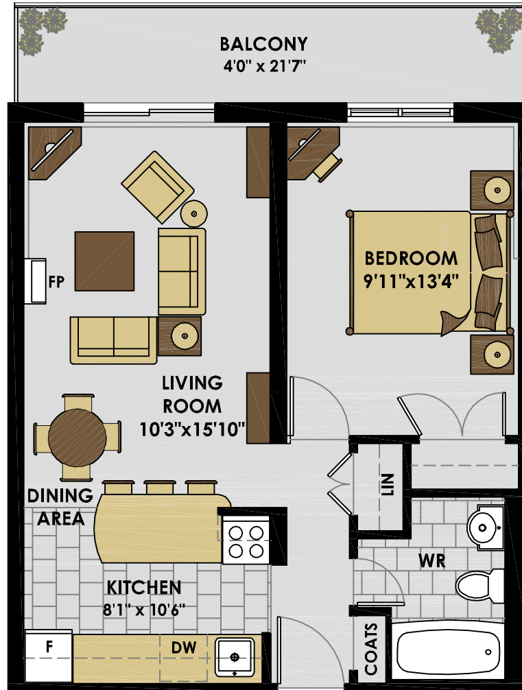
UNIT #204 (Approx. 553 s.f.)