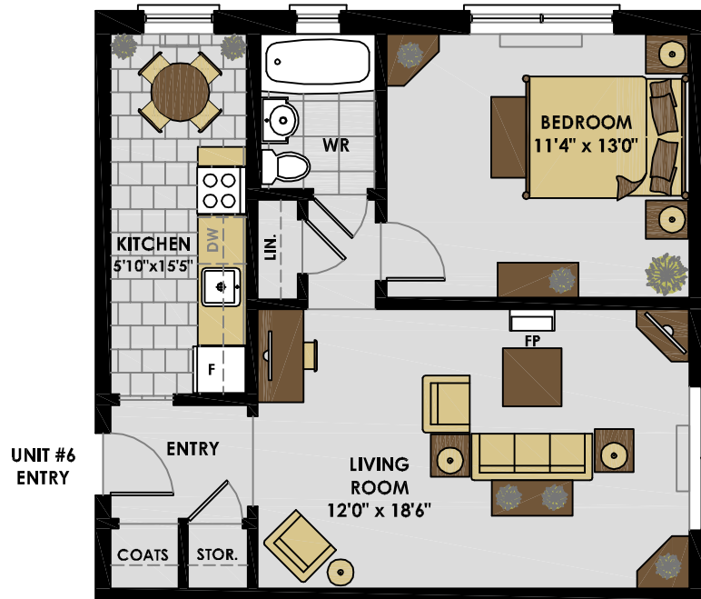
GROUND FLOOR PLAN UNIT #6 (Approx. 650 s.f.)